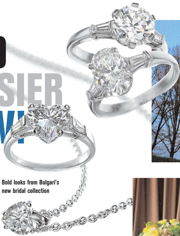
Bold looks from Bulgari's new bridal collection